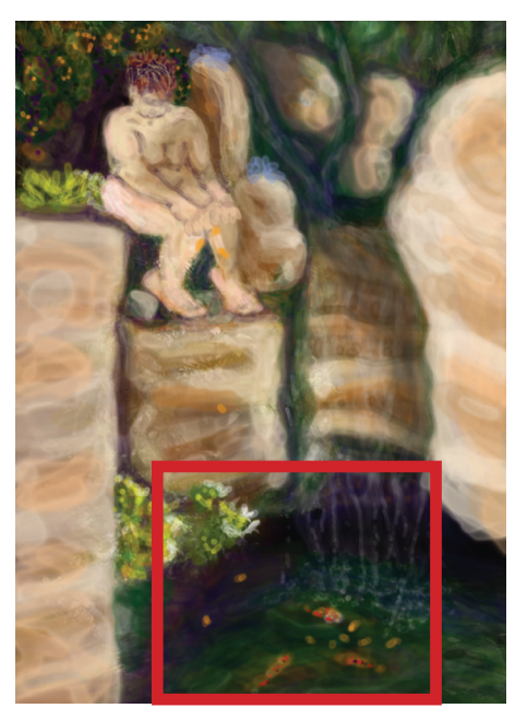
Digital Painting ©2002