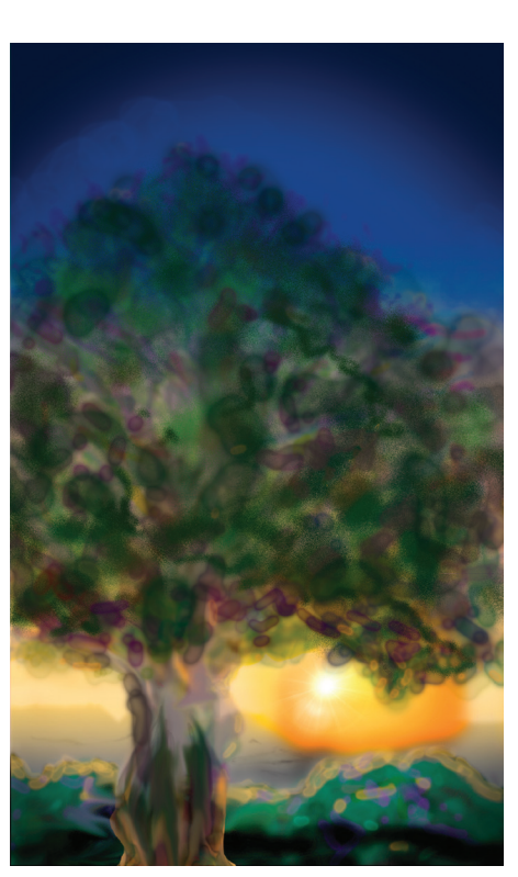
The tree that start me on the digital painting path. ©2001