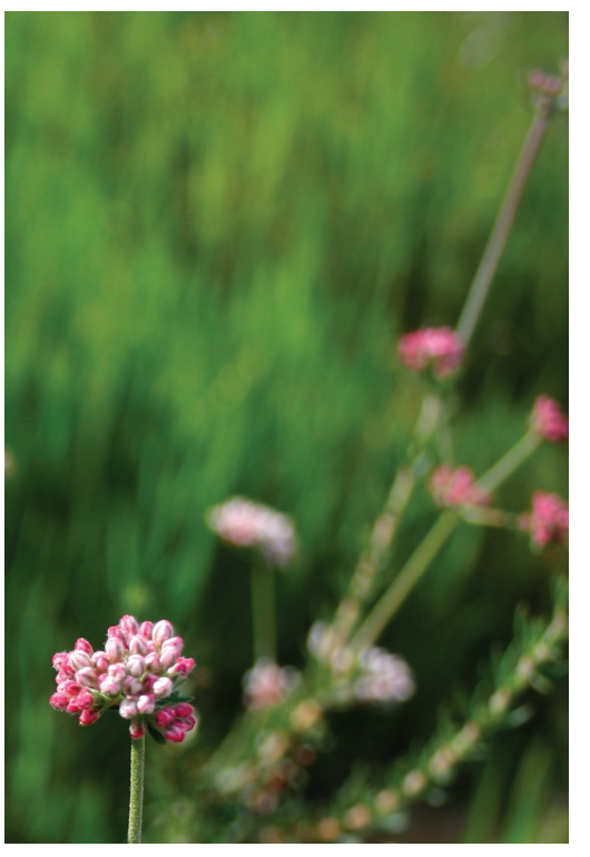
In this enlarged area of the wildflower photo, the blades of grass in the background bear a resemblence to the grass painted in the Fiddleneck wildflower.