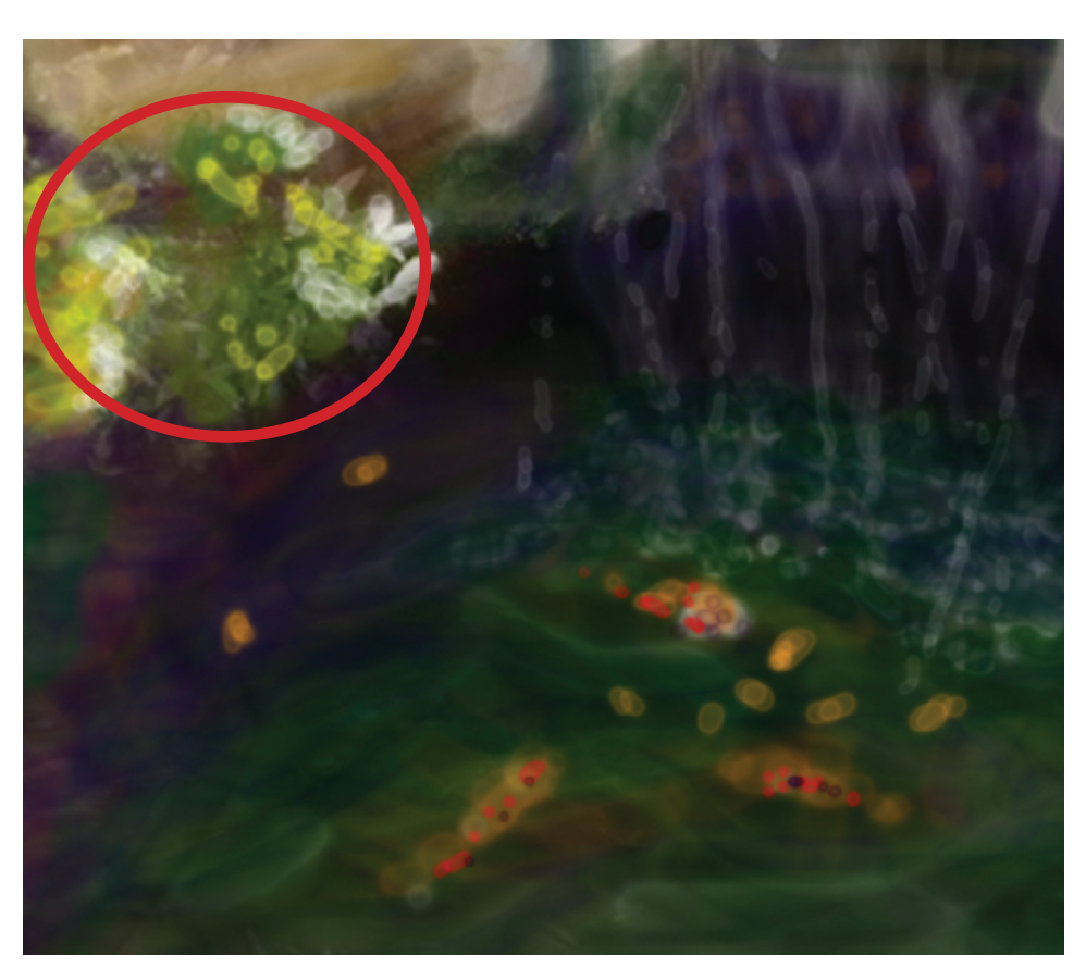
The outgrowth of wildflowers in the rocks was painted with Photoshop's paintbrush on the wet edge setting. By altering color and opacity, the resulting effects are similar to those in achieved with marco photo settings.

Grasses like the ones in these photos can be recreated in Photoshop using the wet edges paint brush. Additionally, contrast can be achieved by stylizing the focal point, as in the vector graphic in this Adobe Illustrator rendering of the wildflower.