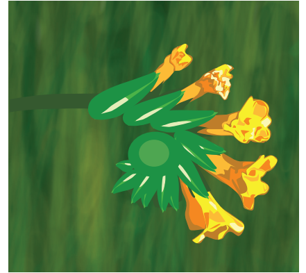
The background grass was painted using Photoshop's paintbrush with wet edges. The foreground is created in Adobe Illustrator using the pen tool with a limited color palette. (Fiddleneck) ©2010