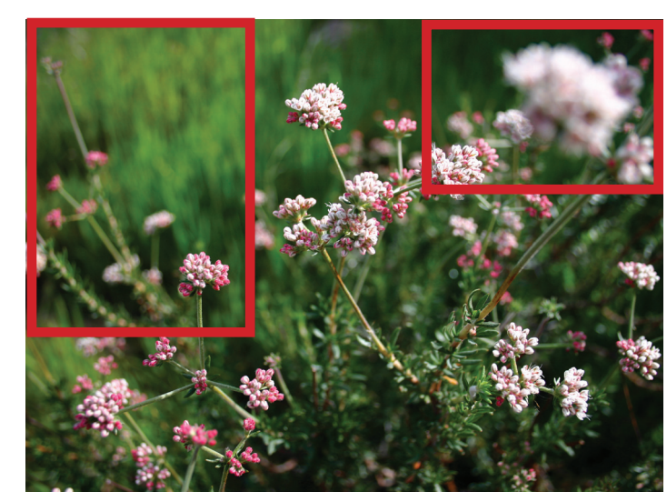
The red rectangles represent the two cropped and enlarged florals shown here.